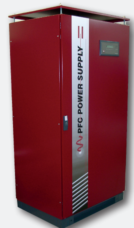
Fig.2 PFC rectifier type Wärtsilä JOVYREC GRP